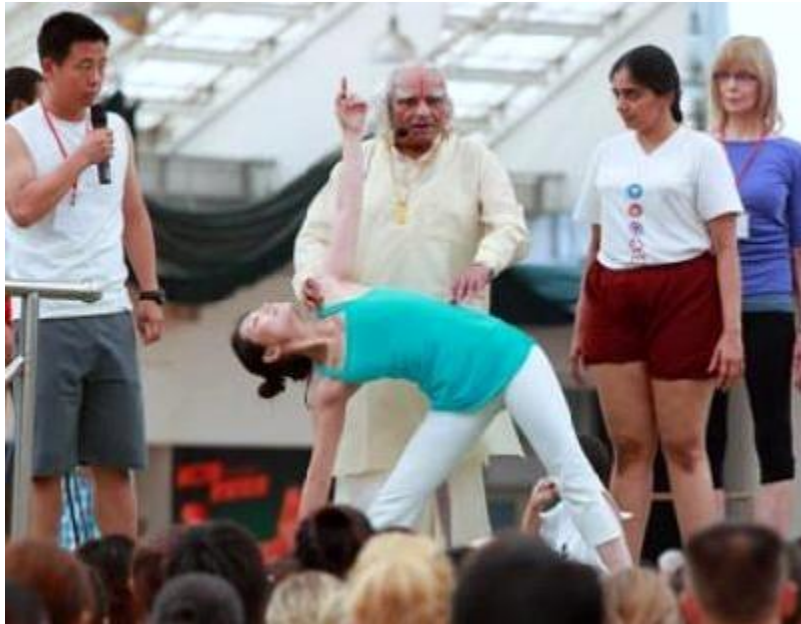
BKS Iyengar teaching 1,200 students in China at age 93 in 2011

the yogic philosophy. His teaching method is now used globally and, arguably, the Iyengar teaching credential is synonymous with the highest level of excellence in teaching and refined depth of knowledge.