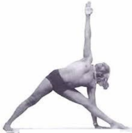
BKS Iyengar at 70+ years