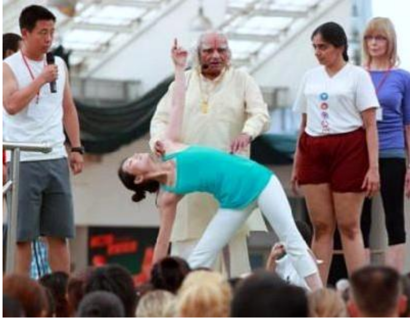
BKS Iyengar teaching 1,200 students in China at age 93 in 2011