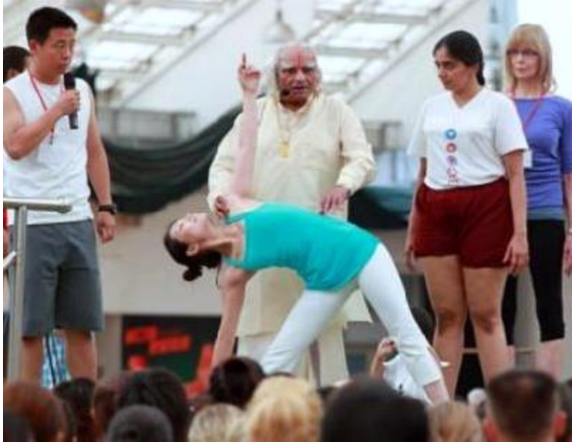
BKS Iyengar teaching 1,200 students in China at age 93 in 2011